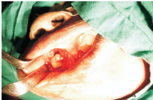
Figure 2: Caldwell Lac approach to remove tooth from the right maxillary antrum